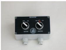
Operating box for Seaview.