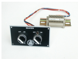
Operating panel for Seaview.