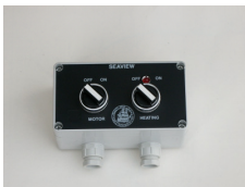
Operating box for Seaview.