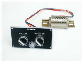
Operating panel for Seaview.